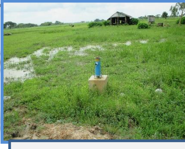
This hand pump is functioned very well. Water is clean and everyone nearby is using this hand pump.