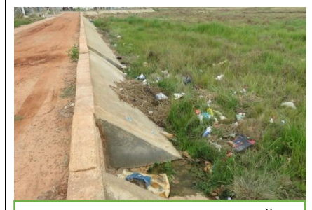
Rubbish at the creek near 6<sup>th</sup> Street