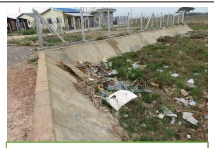
Rubbish at the creek near Main Road C