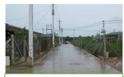
Electricity poles of Main Road B and Road No. 3