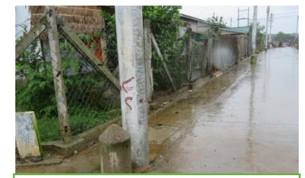
Electricity poles of Main Road