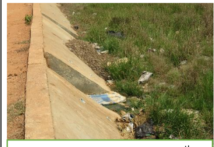
Rubbish at the creek near 6<sup>th</sup> Street