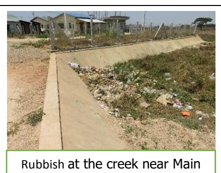
Rubbish at the creek near Main Road C