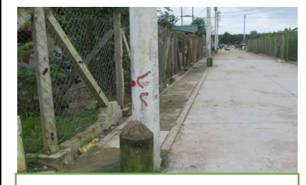
Electricity poles of Main Road B and Main Road C