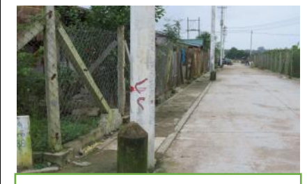
Electricity poles of Main Road B and Main Road C